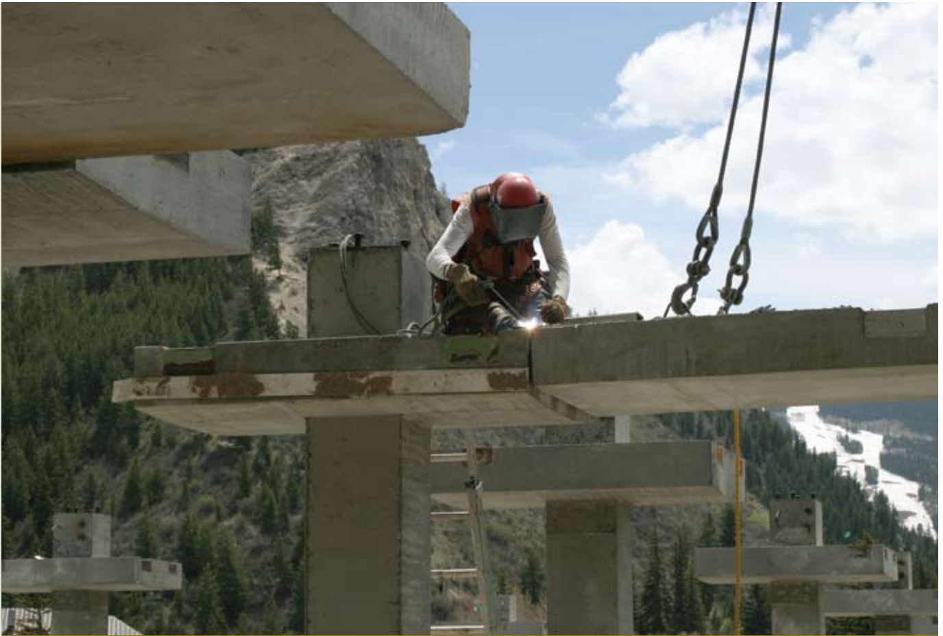
Figure 10. Field welding the Cazaly hangers secures a beam-slab component for the Westin resort hotel in Avon, Colo.