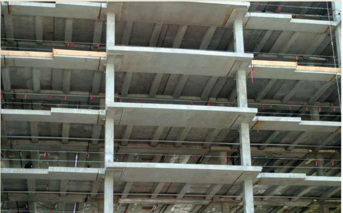
Figure 7. Variable-width beam slabs allowed duplication of balcony and recess geometry in the Westin resort hotel in Avon.