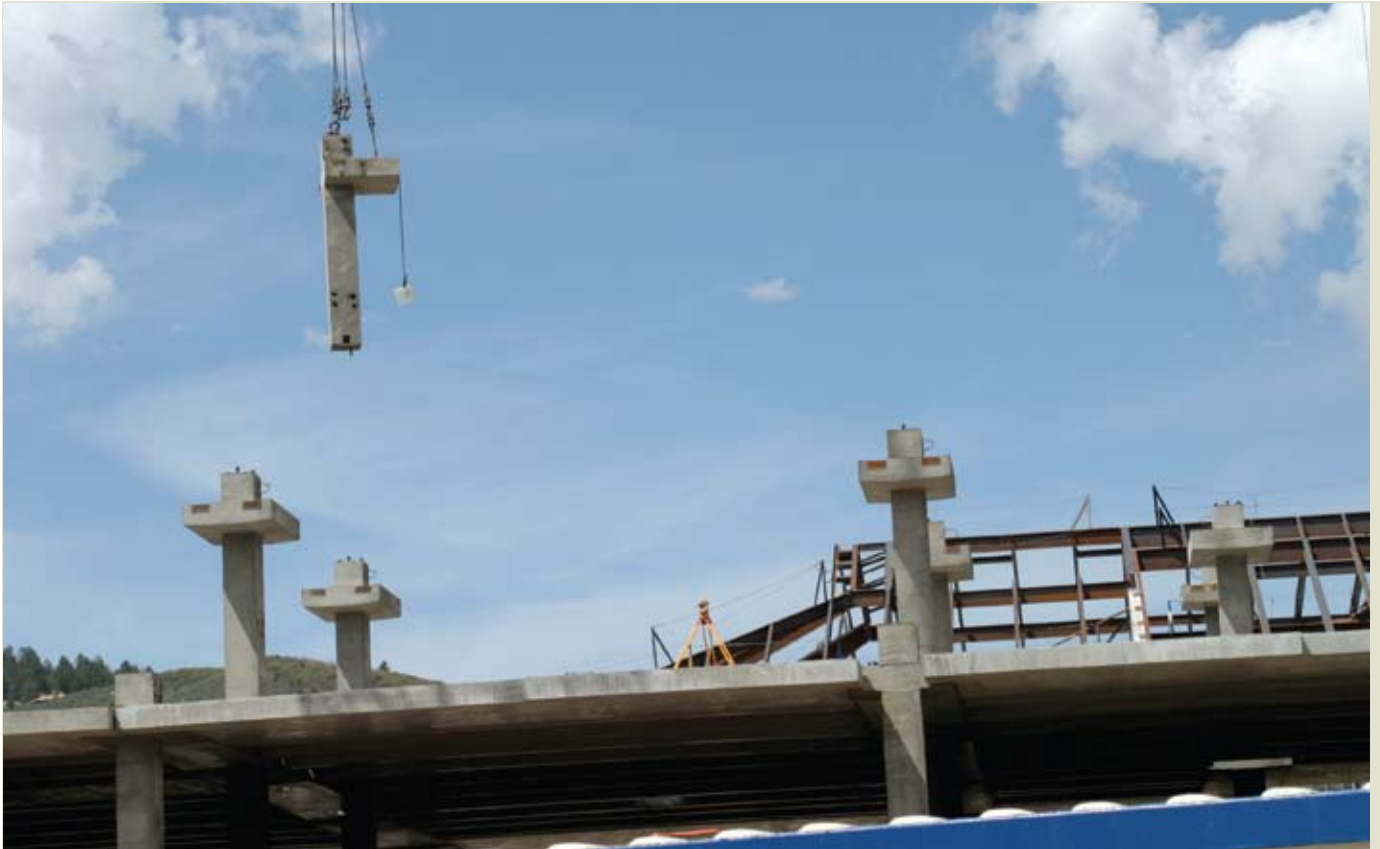
Figure 4. A precast concrete column is being lifted into position for the Westin resort hotel in Avon, Colo.