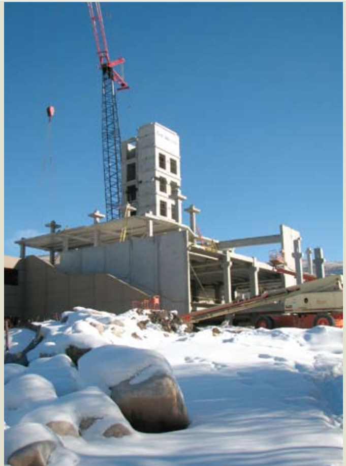
Figure 2. Core components extend above the partially completed Westin resort hotel in Avon, Colo.

The rib slab is a 12-ft-wide (3.7 m), 10-in.-deep (250 mm), modified double-tee with extra-wide webs and a 2-in.-thick (50 mm) slab. Ribs are 6 ft (1.8 m) on center. Hangers in