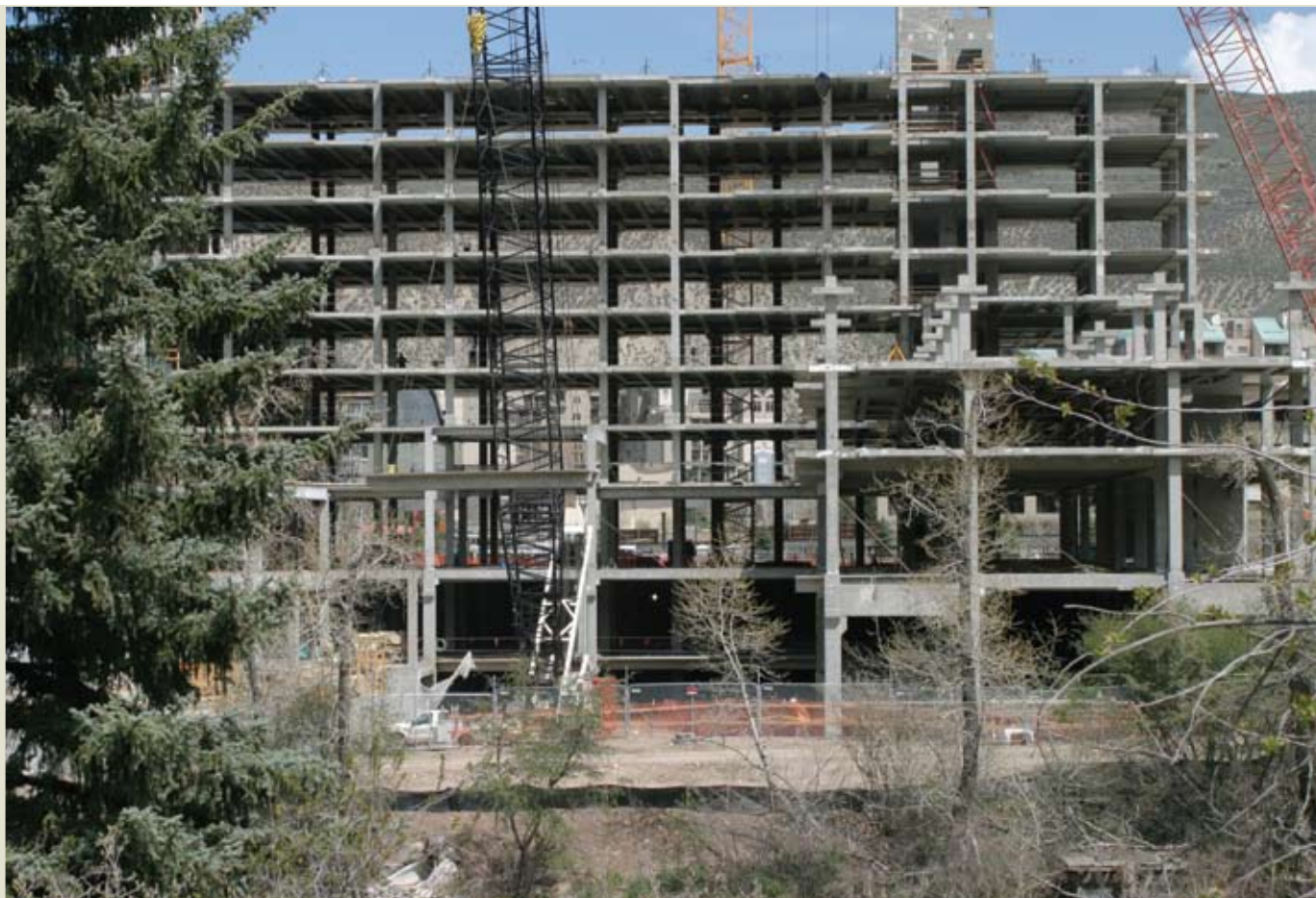
Figure 1. Nine levels of the Avon, Colo., Westin resort hotel complex main tower are erected.

The closest ready-mixed plants are in Edwards, Colo., about 4 mi. (6.4 km) west of the project site, and Eagle, Colo., about 20 mi. (32 km) west of the jobsite. Competing plants to the east were both farther from the site and over Vail Pass. Winter road conditions raised concerns about maintaining the schedule and delivery of quality concrete to the jobsite.