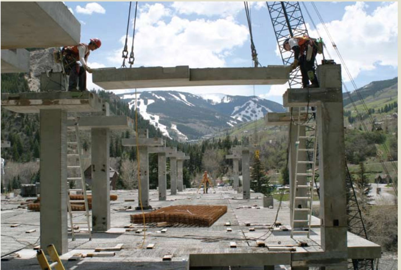
Figure 5. A beam-slab component is placed in position on the column capital for the Westin resort hotel in Avon.