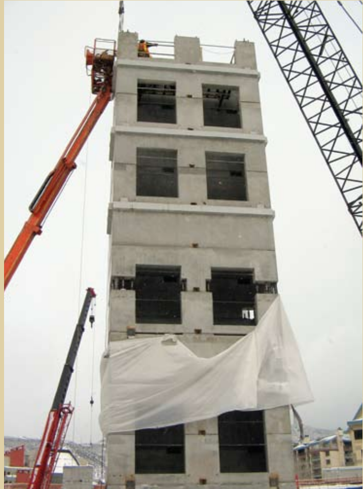
Figure 3. An isometric view portrays the east core tower of the Westin resort hotel in Avon, Colo., sitting on a pony box and a core tower under construction.

and then used skewed rib slabs and wraparound beam slabs to provide the final alignment ( Fig. 8 ). Although this made the connection details less uniform, it provided a stable framing system that fit the building layout.