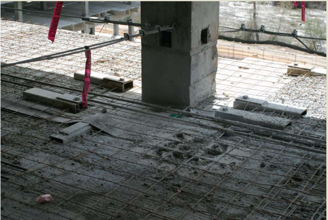
Figure 9. Cazaly hangers support beam slabs on a column capital of the Westin resort hotel in Avon.