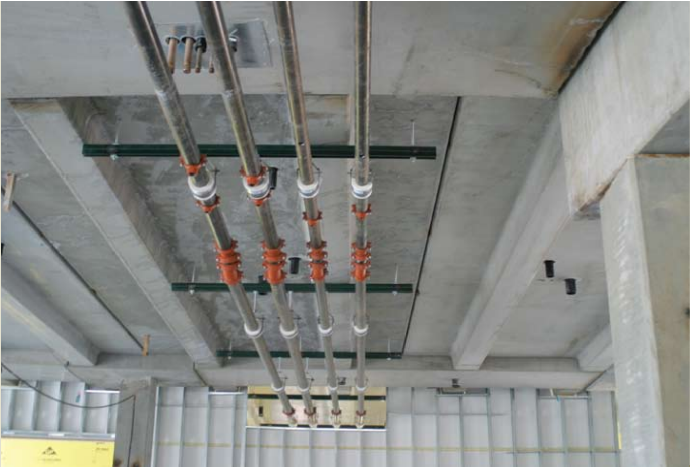
Figure 6. The spaces between the rib-slab stems of the Westin resort hotel in Avon, Colo., provide flexibility for utility placement.