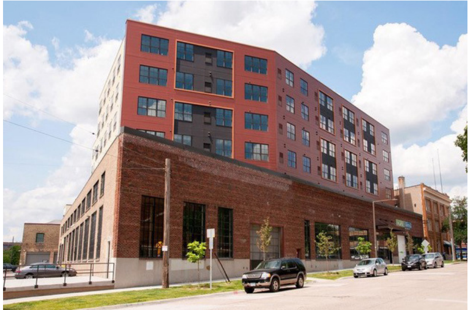
Owner: Steven Scott Management, Inc. • Architect/Engineer: BKV Group • General Contractor: Frana Companies • Hollowcore Erection: Zachman Precast Inc. • Location: St. Paul, MN

Exeter Group worked with BKV Group to develop a bold plan to construct a five-story complex in the middle of the existing structure, while keeping the exterior and several other existing walls intact. This plan created several challenges. First, the building's interior would have to be demolished while the outer shell was kept in place. Keeping the façade in place also would limit access to the construction site because the new