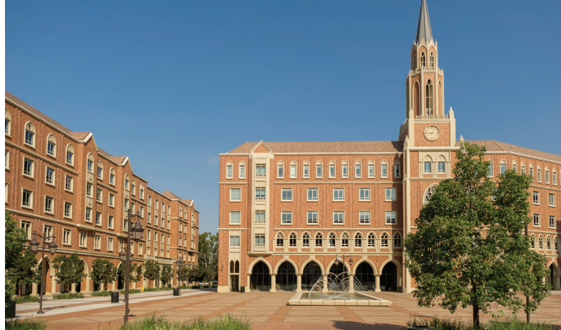
Coreslab Structures (LA) Inc. of Perris, Calif., was recognized with the 2018 Sidney Freedman Craftsmanship Award for its work on USC Village at the University of Southern California in Los Angeles.