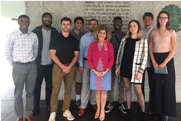
Clemson University students visited the Embassy of Brazil in Washington, D.C., as part of their precast studio.