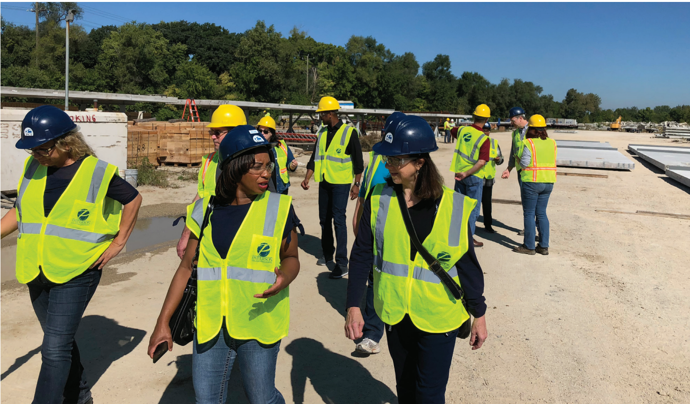
PCI staff members tour Illini Precast September 14, 2018, in Romeoville, Ill.