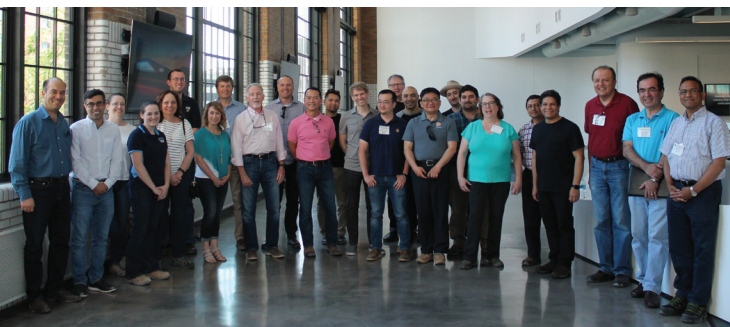
The 2018 PCI Foundation Professors Seminar was held at Washington University in St. Louis, Mo., and included a visit to Gensler's St. Louis office.

This year's participants were Atlanta Structural Concrete Co. of Buchanan, Ga.; Conewago Precast Building Systems of Hanover, Pa.; Crossland Prefab of Columbus, Kans.; Forterra Structural Precast LLC of Salt Lake City, Utah; Forterra Structural Precast LLC of Caldwell, Idaho; International Concrete Products Inc. of Germantown, Wis.; International Precast Solutions LLC of River Rouge, Mich.; Mid-States Concrete Industries of South Beloit, Ill.; Northeast Prestressed Products LLC of Cressona, Pa.; Prestressed Casting Co. of Springfield, Mo.; Prestressed Concrete Construction LLC of Newton, Kans.; Rocky Mountain Prestress (Architectural Plant) of Denver, Colo.; Rocky Mountain Prestress (Structural Plant) of Denver, Colo.; Standard Concrete Products of Atlanta, Ga.; Standard Concrete Products of Savannah, Ga.; and Wells Concrete of Albany, Minn.