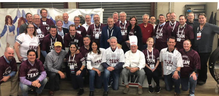
Sustaining donors were on hand to celebrate the success of another year of PCI Foundation programs during the Concrete Chefs fundraiser for the PCI Foundation at the JVI headquarters in Lincolnwood, Ill.

The dinner celebrates those PCI Foundation team members who have made an individual personal commitment to help fund the PCI Foundation. Each year, these individuals make monthly, quarterly, or annual personal donations totaling about $60,000 per year to the PCI Foundation. To become a PCI Foundation Team member, visit the PCI Foundation website at PCI-Foundation.org .