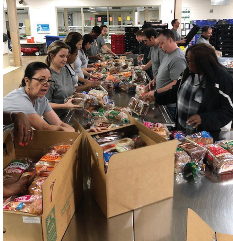
PCI staff members work the bread packing line at the Greater Chicago Food Depository September 26, 2018, as part of a volunteer effort.

The program is free to qualified attendees, and hotel costs for U.S. professors of architecture, engineering, and construction management will be paid by the PCI Foundation. Local partners are encouraged to attend with a professor. Beginning in 2019, professors who receive a grant from the PCI Foundation must attend the Professors Seminar or the PCI