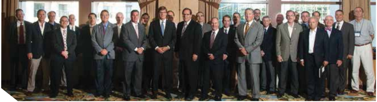
New members were elected to serve on the 2014 PCI Board of Directors at the 2013 PCI Convention and National Bridge Conference in September in Grapevine, Tex.