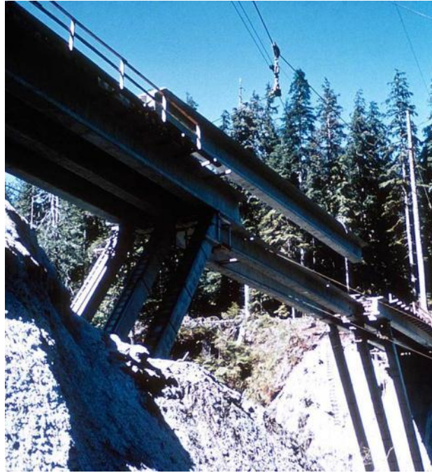
Fig. 3 Sollecks River Bridge Erection