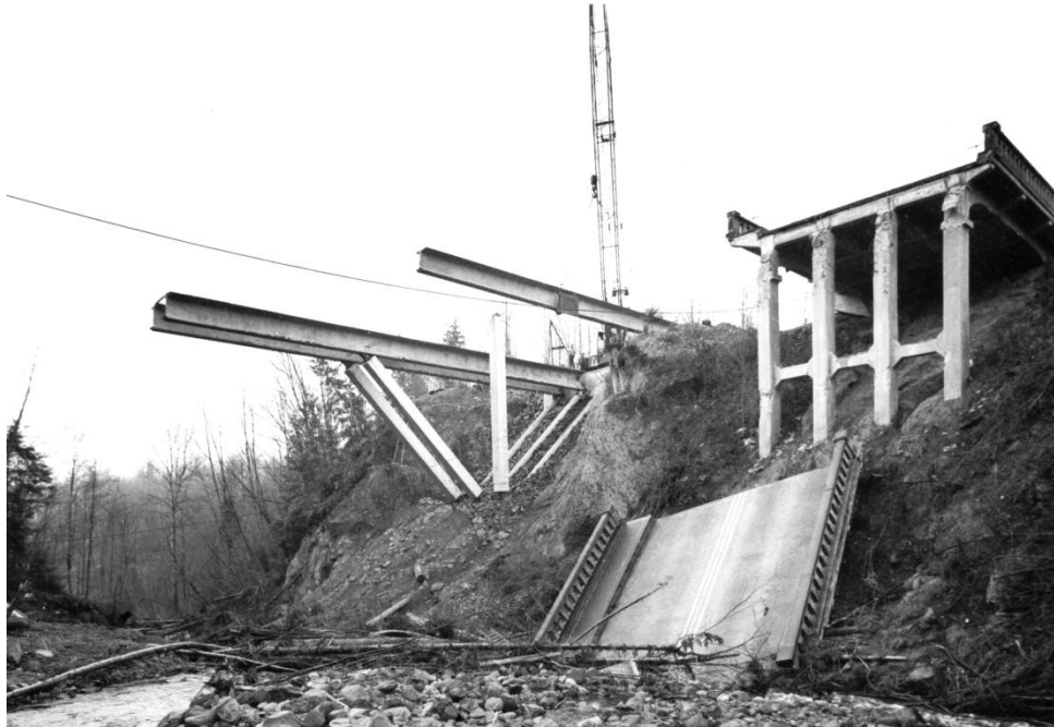
Fig. 4 Scatter Creek Bridge During Erection