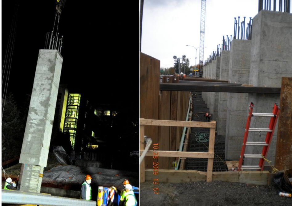
Fig. 11 Northeast 36th Street Bridge