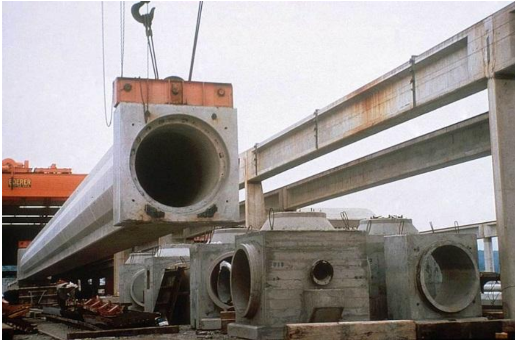
Fig. 5 Interceptor Sewer