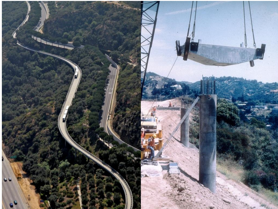
Fig 9. Getty Center

Three days after the final punchlist was conducted on the facility, the 1994 Northridge earthquake struck putting the guideway to a full-scale lateral load test. The structure, which had been designed to a composite Los Angeles Uniform Building Code and Caltrans criteria, survived without damage.