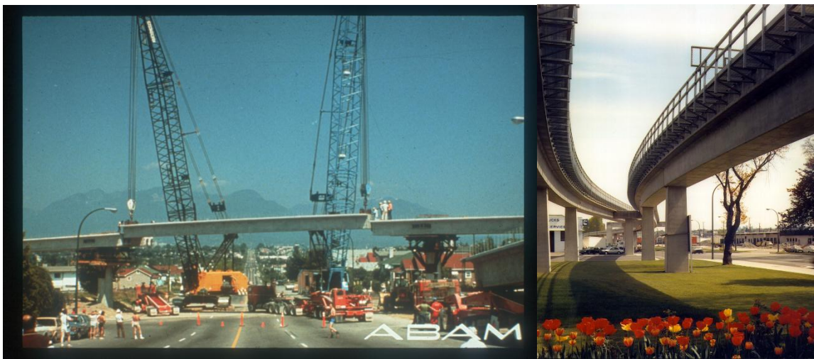
Fig. 8 Vancouver, BC, SkyTrain

Again a unique case-specific solution and blend of precast and CIP elements were used. The facility is still in use today.