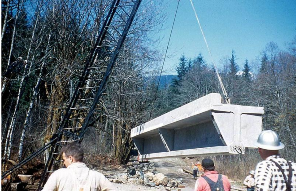
Fig. 2 Early Deck-Bulb Tee Being Placed in Washington State