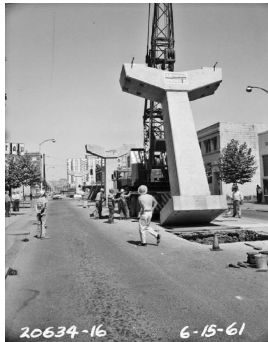
Fig. 6 Erection of the Seattle Monorail

columns/crossheads that today fall into the ABC category. Nonetheless, the longevity of the structure has proven durability of the details used, and that fact is helpful to engineers today, who are trying to build structures rapidly but also trying to make them durable.