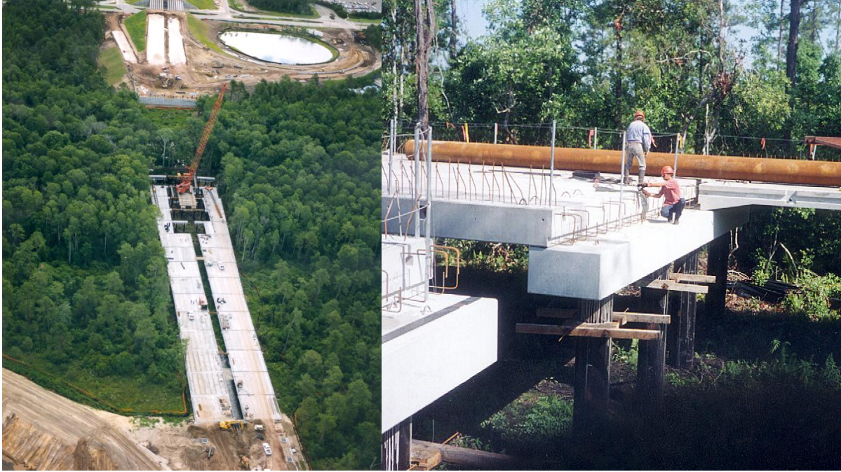
Fig. 10 Reedy Creek Bridge