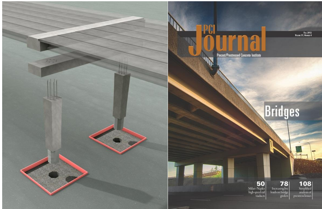
Fig. 12 Highways for LIFE Demonstration Project – U.S. 12 Bridge of I-5

The central premise of the precast pier system is that the columns can be cast off site along with the cap beam. Then, these pieces are brought on site for erection minimizing construction time in the traveled way improving both maintenance of traffic and site safety for the traveling public. It is expected that this standardized bent system will become a viable tool in the toolbox for building these typical prestressed girder bridges in high seismic regions.