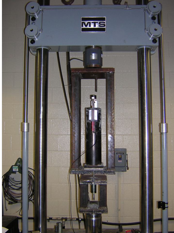
Figure 1: STSB Load Frame Apparatus