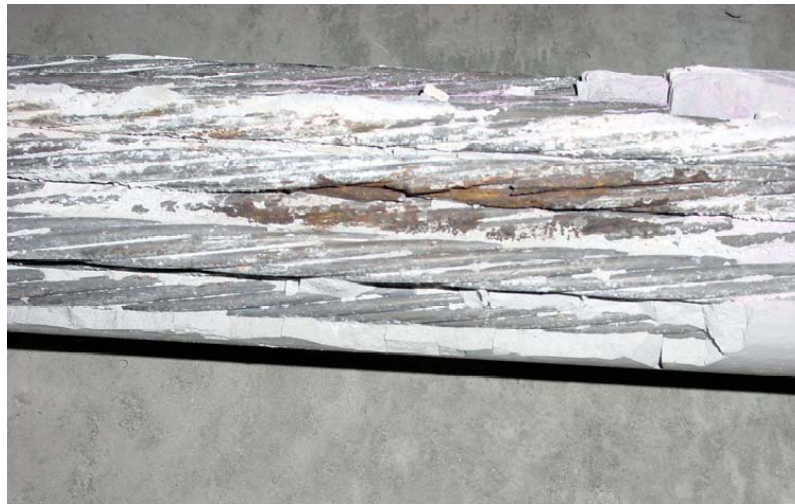
Figure 1 – Corroded post-tensioned tendon, Mid Bay Bridge

-Failure of 1 vertical post-tensioned tendon in one of the piers due to corrosion of strand.