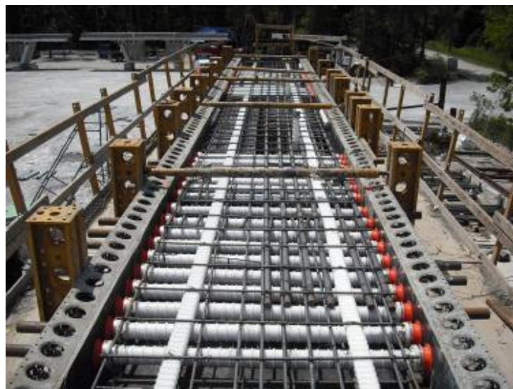
Figure 6 – Pier segment with multiple duct couplers

What makes the development of these couplers difficult to achieve is that in providing the protection outlined above these couplers cannot inhibit the face to face mating of the two adjoining segments during erection as this can cause serious problems with the structure. What also must be realized when developing these couplers is the amount of pieces needed for the structure. The Jacksonville North Interchange Bridge, which has a length of only 2,654 feet, has approximately 2500 sets of couplers required for the entire structure. As is seen in Figure 6, there is little room for them in the deck cross section and they are most often adjacent to each other. With that amount of couplers required, and them needing to be properly aligned there are many opportunities for potential problems.