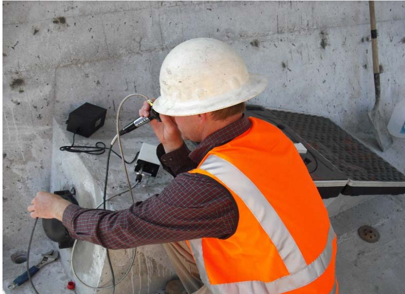
Figure 3 – Borescope inspection

One of the major effects of these on-site field changes were felt, once again, in the contractor's production levels. Because of the built-in wait time required by the new procedures, the production rates were significantly affected. In addition, the individuals performing the work had to adapt to these changes both on the contractor side and the inspection side. It was a real challenge at the beginning of the process to change the thinking of everyone involved who had been accustomed to the "old way" of performing the work. Ultimately the implementation of these procedures was a success due to the commitment of all parties. Although some alterations in the details of these procedures have been made based on field performance and project feedback, this part of the specification also remains in the FDOT specifications today.