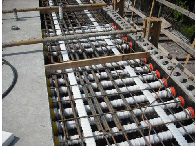
Figure 5 – Ducts prior to pre-casting

What makes the development of these couplers difficult to achieve is that in providing the protection outlined above these couplers cannot inhibit the face to face mating of the two adjoining segments during erection as this can cause serious problems with the structure. What also must be realized when developing these couplers is the amount of pieces needed for the structure. The Jacksonville North Interchange Bridge, which has a length of only 2,654 feet, has approximately 2500 sets of couplers required for the entire structure. As is seen in Figure 6, there is little room for them in the deck cross section and they are most often adjacent to each other. With that amount of couplers required, and them needing to be properly aligned there are many opportunities for potential problems.