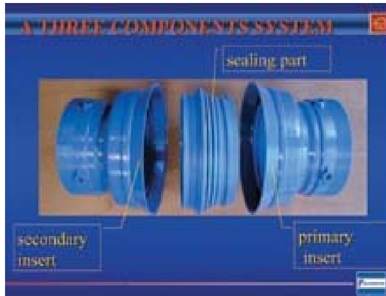
Figure 4 – Freyssinet Lia-Seal Coupler

In future projects the FDOT would re-visit this coupler requirement to pursue the ultimate goal of standardizing their use for all projects. The design and feasibility of segmental couplers would continue to be investigated as well. Currently the FDOT requires a mechanical coupling device for all internal post tensioned tendons that cross over a joint. This requirement is being addressed on current projects as the industry is in the process of developing an effective coupler to meet its intended purpose.