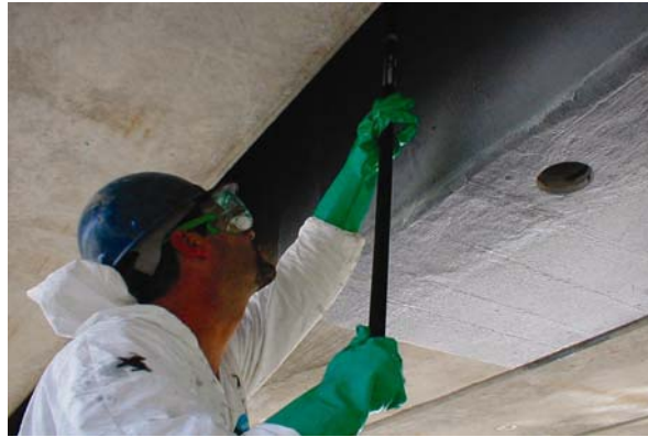
Fig. 12 Installation of carbon fiber fabric

A number of different carbon fiber systems were designed and installed on this project to strengthen the concrete and replace the damaged reinforcement. After repairing all the damaged concrete using conventional means, a carbon fiber wrap (SikaWrap®) was applied to stabilize the diaphragms in the anchor zones. The Plastic Sheet Method (ASTM D4263) was used to test the moisture transmission, ensuring that the repair mortar be cured and the substrate is ready to be bonded with the carbon fiber wrap. The bottom and sides of the diaphragm were mechanically grinded (ICRI CSP-3) to provide an open textured finish and the corners of the beams were rounded to a 1/2" radius per the specifications. A bi-directional, carbon fiber fabric (Fig. 12), impregnated with a high modulus epoxy resin, was then bonded onto the surface. After cure, the beams were ready for the next step in the strengthening process.