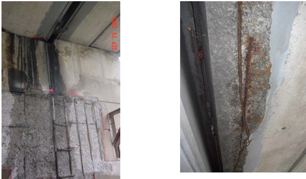
Fig. 10 Typical corrosion problems on Hopkins and Clinton Street Bridges

Due to significant deterioration of the prestressed strands (Fig. 10) in the two bridges, coupled with extensive cracking and spalling of the concrete, a carbon fiber system was selected to restore the flexural strength of the beams. However, to optimize the high strength of the carbon fibers and replace the strands, of which approximately 25% were corroded, an innovative method of post-tensioning was chosen. This was the first time this post-tensioning system, known as the Sika StressHead® System, would be installed in North America, and only the sixth time it would be installed worldwide.