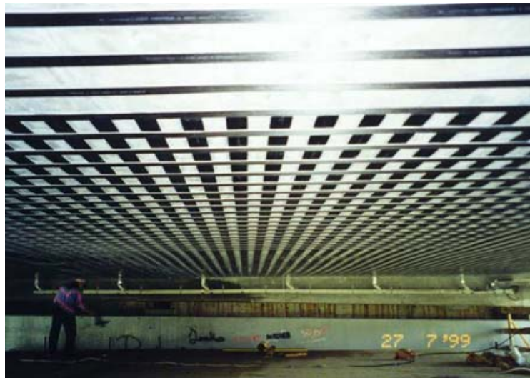
Fig. 3 CFRP Strengthening of concrete slab

Similar to steel plates, composites (Fig. 3) are used as supplemental reinforcement by providing passive restraint. However, their high strength:weight ratio makes them very desirable as a strengthening material, rendering steel plate bonding essentially obsolete for infrastructure repairs.