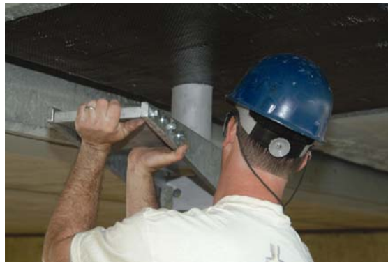
Fig. 6 Live end anchorage