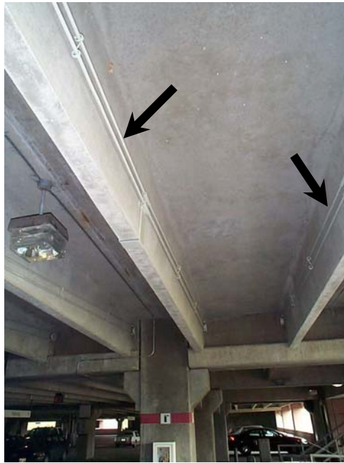
Fig. 1 External post-tensioning in parking garage