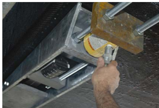
Fig. 14 Post-tensioning force being applied with hydraulic ram

Due to a slight camber in the beams, a deviator (guide plate) was used to ensure the carbon fiber plates would remain intact with the bottom of the beams after tensioning. The location of the deviator varied depending on the length and curvature of the beams. The contractor had previously surveyed the beam and noted elevations at 5 foot (1.5 m) increments to design for the camber and to calculate the exact length needed for the factory mounted plates, since the tolerance was only 2 in. (50 mm).