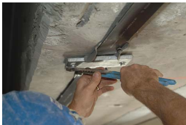
Fig. 7 Deviator plate installed mid-span