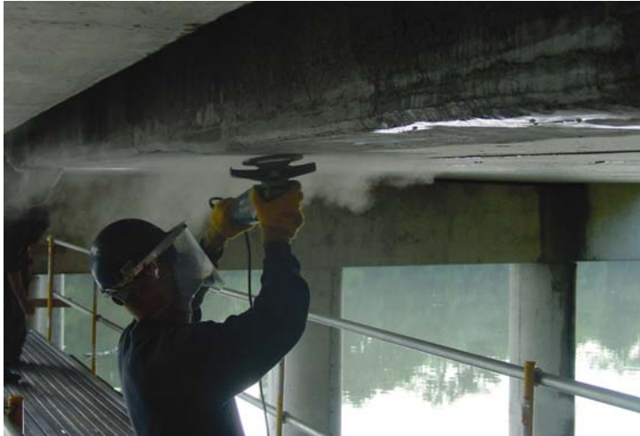
Fig. 11 Concrete surface preparation with grinders

The beams were accessed using cantilevered stages, connected by 40 feet long aluminum platforms. Hardhats, safety glasses, face shields, dust masks, skin protective clothing, gloves, earplugs and handrails were utilized for safety measures.