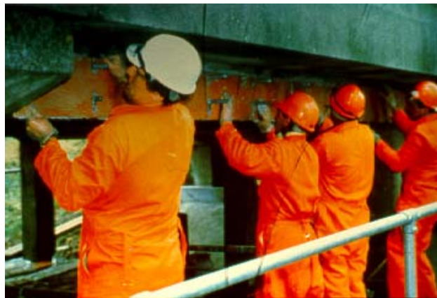
Fig. 2 Steel plate bonding on bridge beam

Steel plates have been used to strengthen and stiffen concrete since the 1960's. The plates are typically bonded onto the concrete with an epoxy resin in conjunction with anchor bolts to provide shear transfer, and to temporarily hold the heavy plates while the adhesive cures (Fig. 2). This method can add tensile and/or shear strength to a reinforced concrete member, depending on its orientation and placement. Unlike external post-tensioning, this is a passive method of reinforcement, meaning the steel plates do not engage unless there is deflection in the member.