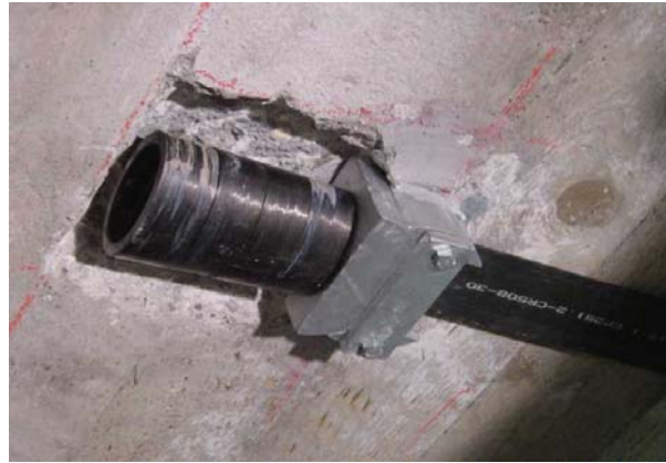
Fig. 5 Fixed end anchorage