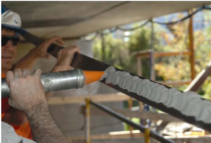
Fig. 13 Epoxy resin being applied onto carbon fiber plates

In addition to post-tensioning the plates, they were also bonded onto the concrete with an epoxy resin (Fig. 13). This provided additional stability, offered a balanced failure mode, and was also done to prevent moisture or frost from getting behind the plates over time. The carbon fiber plates were jacked in tension to forces ranging from 19,000 pounds (84 kN) to 36,000 pounds (160 kN), depending on the capacity of the diaphragms (Fig. 14). The capacity of the diaphragms was calculated via ACI using f'c determined through testing the cores taken for the anchors. This force was pre-determined by the Engineer and measured with a calibrated hydraulic ram, gauge and pump assembly. A Stressing Journal was kept by the Inspector which noted parameters such as the beam location, the location of the anchorages, the length of the plate, the displacement in the plate, the strain, and the stressing force.