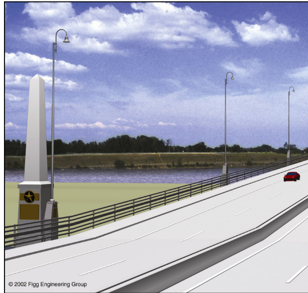
Fig. 4 Commemorative Monument Design