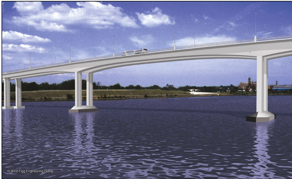
Fig.1 Proposed Victory Bridge (rendering)