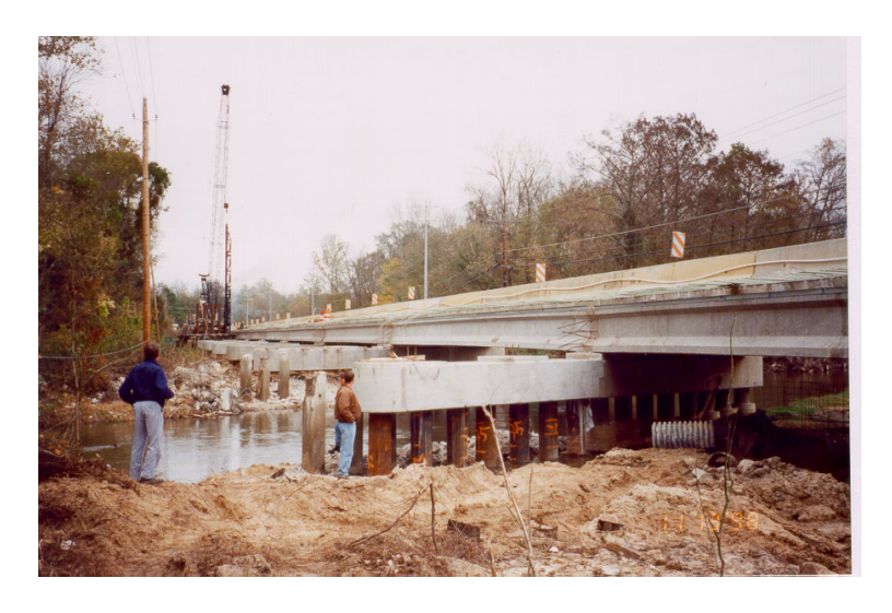
Fig. 4 Precast bent caps on Route 5 Bridge over Wolf River in Tennessee

US 290 Ramp G in Austin, Texas: The contractor asked TxDOT for approval to precast the straddle bent cap when it became apparent that formwork for a cast-in-place cap would interfere with traffic and require closing the ramp for an estimated 42 days. The cap was precast adjacent to the site and lifted into place, requiring total ramp closure of only 8 days.