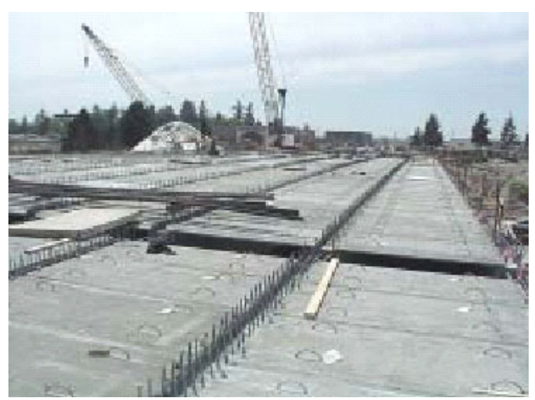
Fig. 1 Partial-depth precast concrete deck panels on I-5 Interchange in Tacoma, Washington

■ I-5/South 38<sup>th</sup> Street Interchange in Tacoma, Washington: The Washington State Department of Transportation minimized traffic disruption by reducing construction time for its two-span, 325-foot replacement bridge over I-5 in Tacoma. With no need to construct and remove conventional deck forms, lane closures on I-5 were greatly reduced.