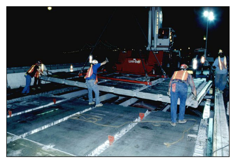
Fig. 2 Full-depth deck panels on Tappan Zee Bridge over Hudson River in New York

Dead Run and Turkey Run Bridges on the George Washington Memorial Parkway in Virginia: To minimize traffic disruption for more than 42,000 vehicles per day during deck replacement on these George Washington Memorial Parkway bridges, the National Park Service used prefabricated full-depth deck panels and required construction crews to work on weekends only. Replacing the non-composite deck on one span per bridge per weekend, the crews kept all bridge lanes open for commuter traffic from Monday morning to Friday evening.