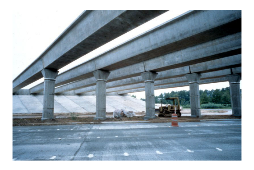
Fig. 5 Precast piers at Louetta Road Overpass on State Highway 249 near Houston, Texas