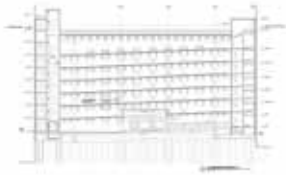
This section drawing shows the greater number of modified precast concrete double-tees used to support the increased loading of the rooftop garden. Courtesy of Stott & Associates Architects PC.