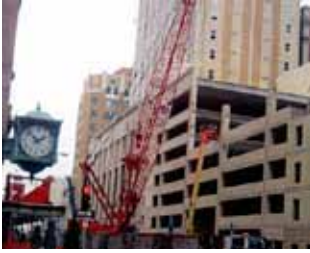
Construction was possible from only one side of the 915 Walnut Street Parking Structure in downtown Kansas City, Mo.