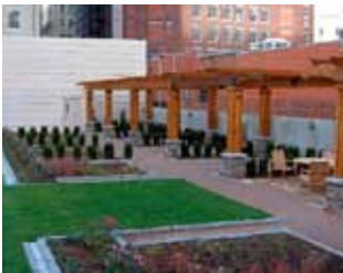
A 16,000 ft 2 rooftop garden, the largest elevated garden in Kansas City, Mo., graces the top of the seven-level 915 Walnut Street Parking Structure.

The crown jewel of the facility is its rooftop garden. Additional loading was calculated and provided by IPC, the precaster, to ensure that components would support the added soil and plants and the added load as the trees and landscaping mature. Eight inch double-tees were used to meet this need. The project also called for precast concrete columns, ledge beams, stairs, spandrels, wall panels, and shear walls.