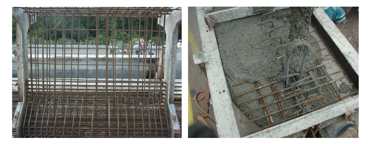
Fig. 1 Beam mock-up section