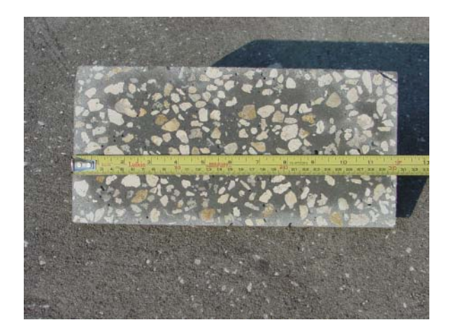
Fig. 5 Coarse aggregate measurement along the length of the core sample