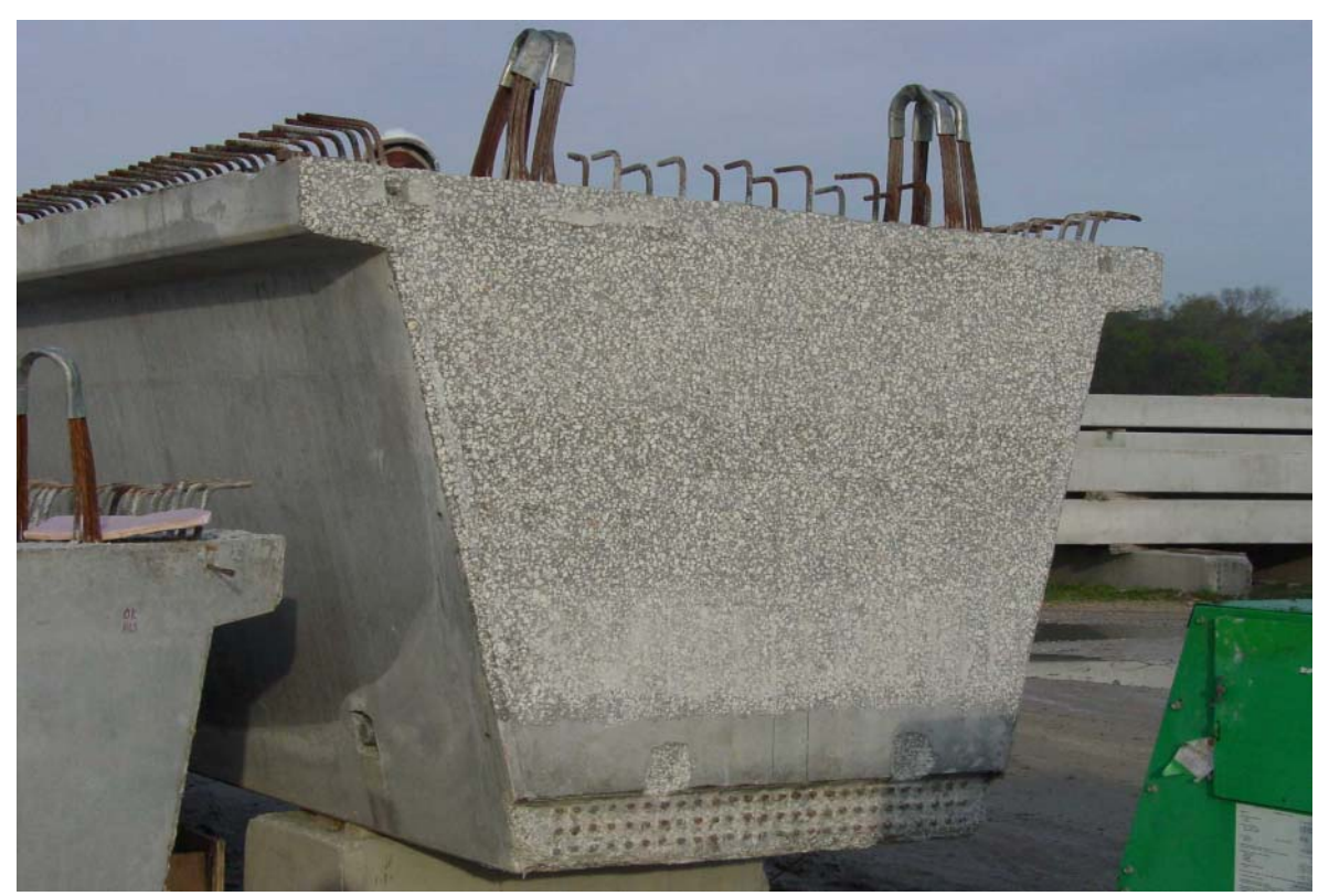
Fig. 13 Exposed header of U-beam shows the uniformity of aggregate distribution