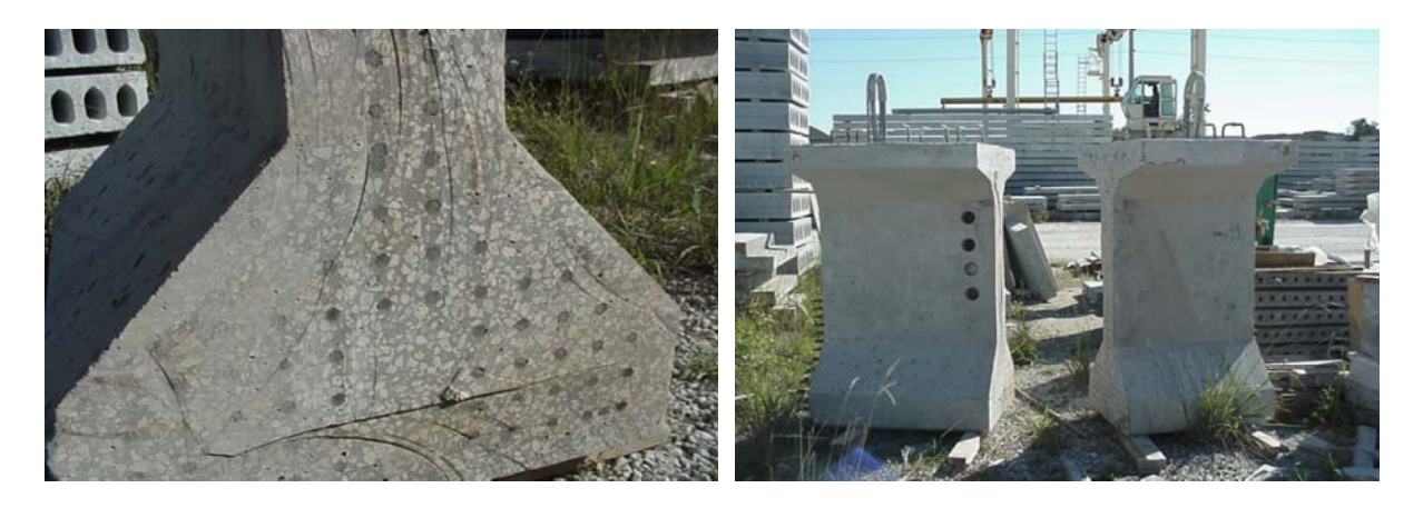
Fig. 2 Casting with flowing concrete