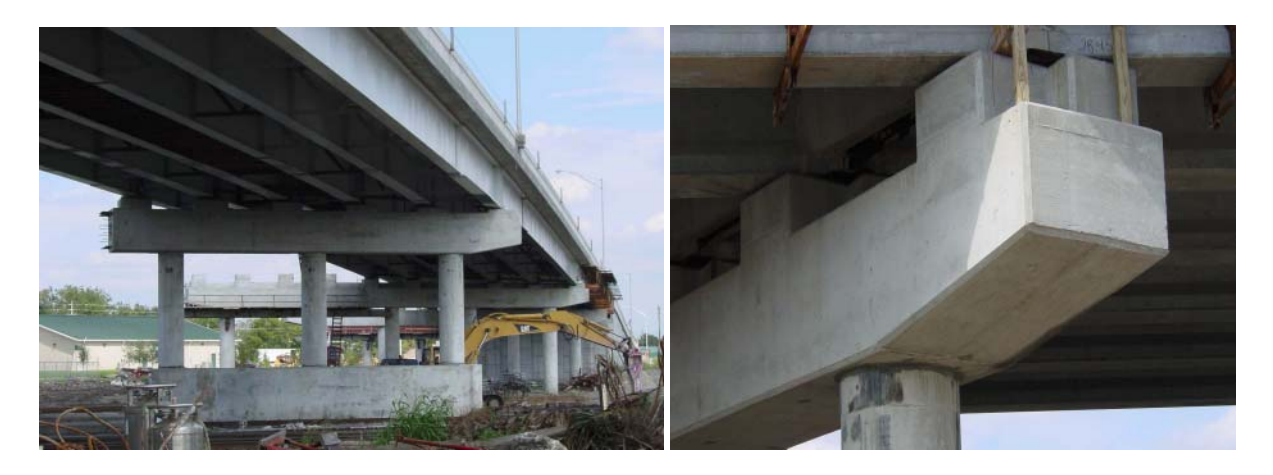
Fig. 8 The Beaver Street project siteFig. 9 Beam produced with FC

The report of this project shows that fifty beams were cast without any sign of honeycombs (Fig. 9). The time for the consolidation of the concrete, by mechanical means, was reduced to almost half of the time used for the consolidation of the conventional of HRWR concrete. Five percent of the delivered concrete was rejected, exceeding the specified slump parameters. Three batches were rejected due to slump less than 7.5 inches and five batches due to slump greater than 10.5 inches. This rejection rate may be normal for a class of concrete with new admixtures that is attempted for the first time. Workability of the concrete mix has been considered to be good.