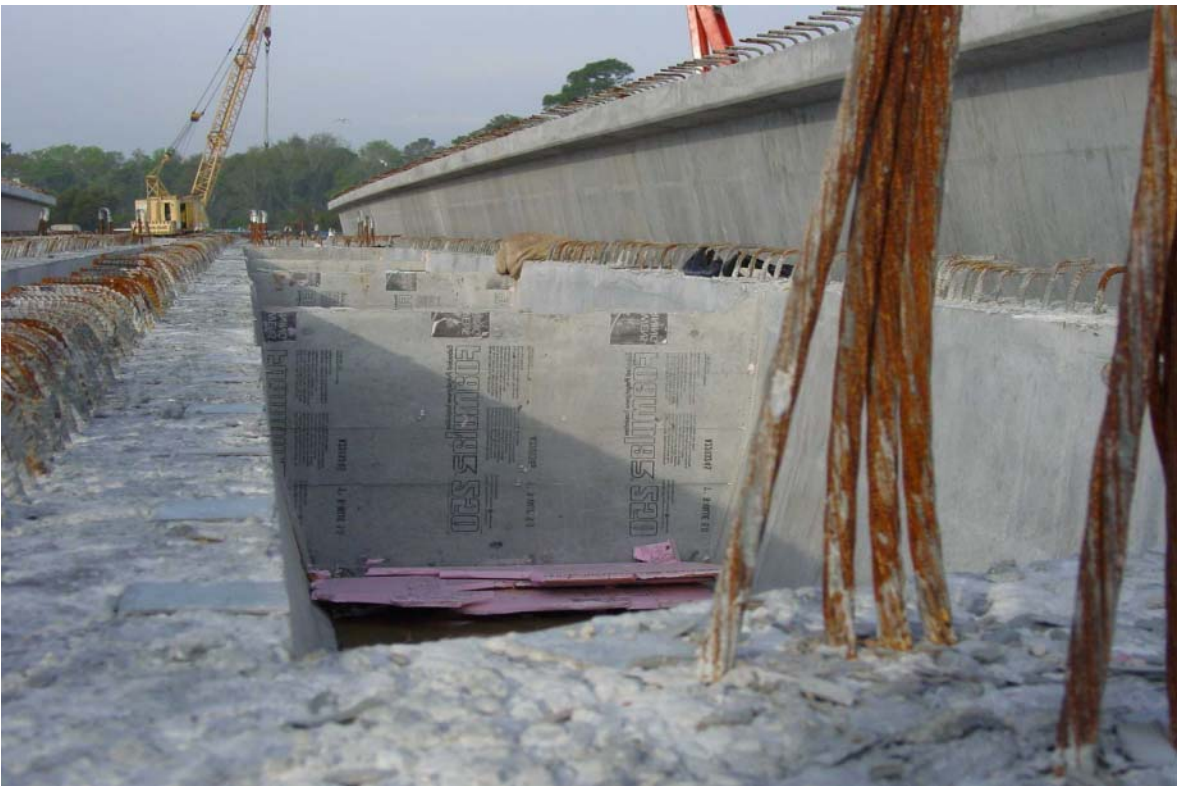
Fig. 12 U-Beams for the SR 9A – I-95 – I-295 projects, inside and outside surface finish

Mujtaba and Bühler 2003 International Symposium on High Performance Concrete