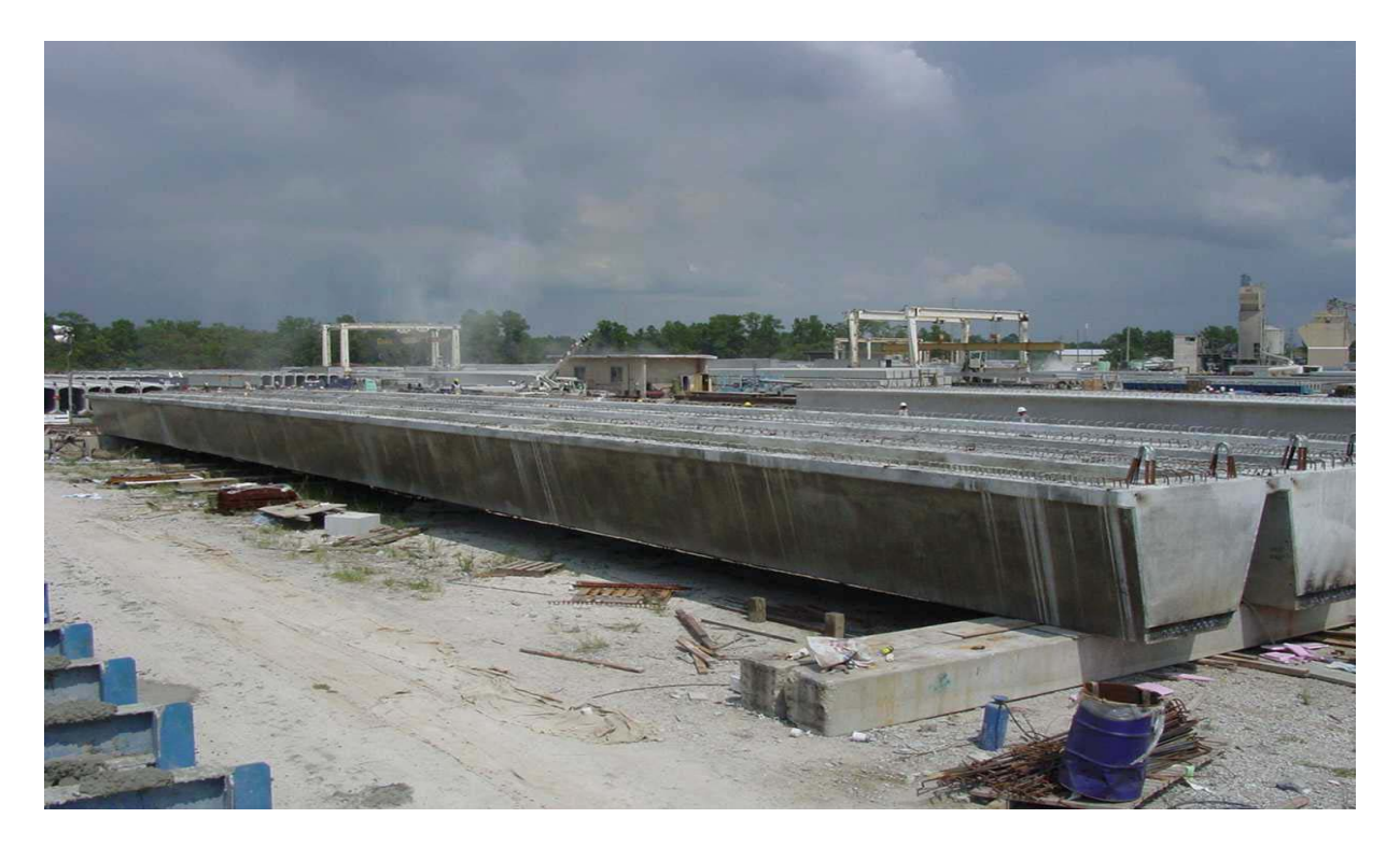
Fig 14 Florida U-Beam at Storage