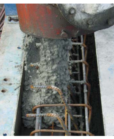
Fig. 10 Formwork for U-beam